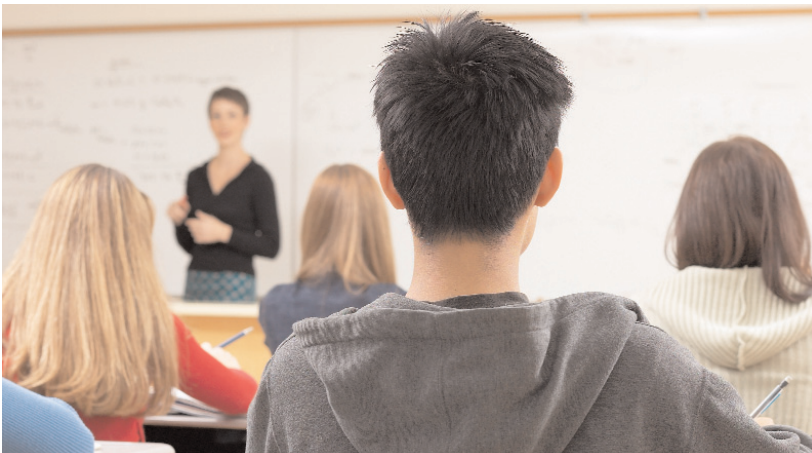
Fairfield University houses approximately 2600 students.

The Fairfield University campus consists of 200 acres with 34 major buildings including 8 student residence halls and 105 town-house units. Fairfield University houses approximately 2600 students, and over 95% of the incoming class lives on campus. First year students live in one of four traditional residence halls. All halls are coed by floor or by wing and have commonly shared lounges, usually on each floor.