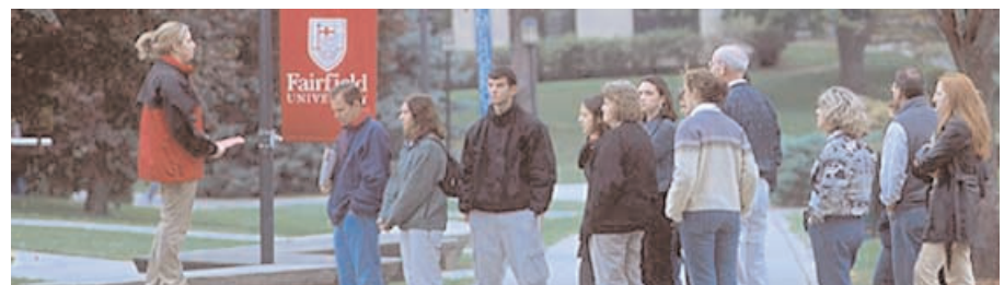
Fairfield University provides campus tours to new students and their parents.

"Munters rentals and sales divisions are to be commended, the knowledge and input from all with what we had to deal with was of the highest caliber. I was an outside contractor for 27 years before I came to Fairfield. I had seen Munters units in action before; they are definitely the Cadillac of their class."